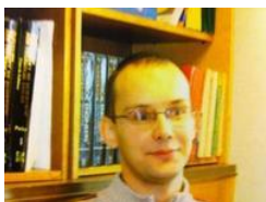
Faculty Erasmus+ Coordinator (Area of activity – Power Engineering)

Admission hours: To be agreed via e-mail